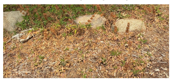
-Same plant later, after dousing with brief shower-